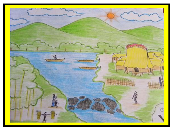
The Vinh Son artists focus their creativity on scenes of village life and natural surroundings